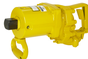
IW24 (NON CE)

The STANLEY IW Series of tools are medium to extreme duty square drive impact wrenches designed for some of the toughest underwater bolting applications. Powered by a integral STANLEY Hyrevz motor, our impact wrenches have an impact intensity ranging from 250 ft lbs of torque to 3,500 ft lbs of torque. Designed to run from a wide range of hydraulic circuits, this wrench allows underwater bolting in the most extreme applications. Hi-visibility yellow paint is standard.